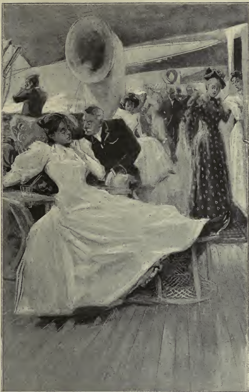
THE VOYAGE BY P. AND O.